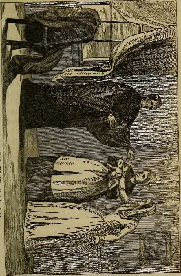
MOTHER ABBESS STRANGLING THE INFANT — Part II., p. 62.